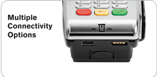
Multiple Connectivity Options